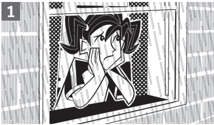
She's bored .

worried unfriendly excited interested bored friendly